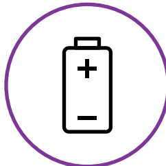
Alkaline & carbon