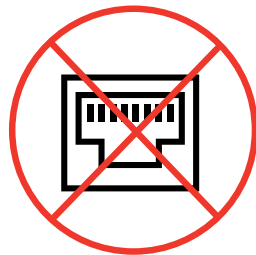
Toner & printer cartridges